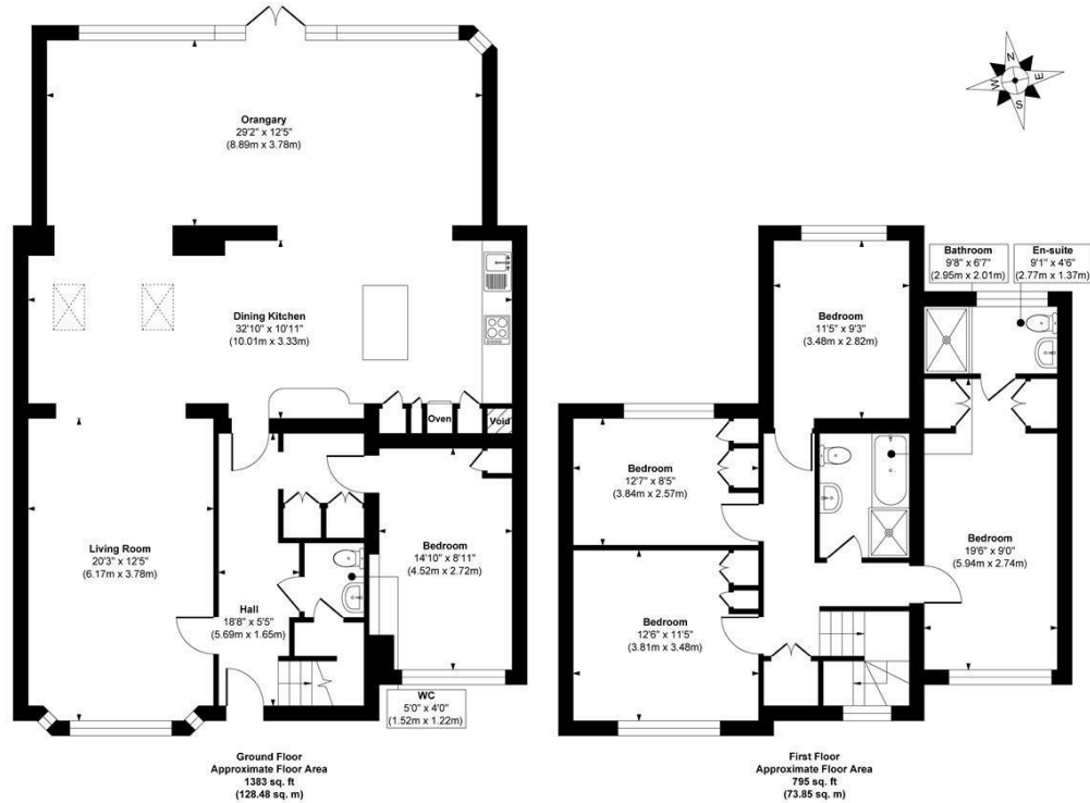
Approx. Gross Internal Floor Area 2178 sq. ft / 202.33 sq. m Illustration for identification purposes only, measurements are approximate, not to scale. Copyright © Zenith Creations.